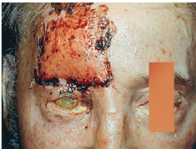
Figure 4. Herpes zoster ophthalmicus

merous additional potential findings associated with the pain and rash. Motor nerves may be involved in 5%–15% of cases in which the nerves (especially those in muscles in the extremities) can be examined adequately. By use of electromyography, it is possible to show that muscles are involved in 50% of cases [47]. Obvious paresis typically improves over time and may respond to physical therapy (figure 5). The geniculate ganglion also contains latent VZV derived from facial, aural, and oral lesions of varicella. Reactivation in the geniculate ganglion can lead to facial nerve (VII) paralysis (because sensory and motor nerves are conjoined in nerve VII), as a result of a bystander effect. VZV and HSV account for the majority of cases of Bell palsy (idiopathic facial paralysis). In the absence of skin lesions, the etiologic role of VZV or HSV reactivation is not clinically obvious and must be determined by use of laboratory methods [48–50]. It has been suggested that, because of the involvement of VZV or HSV, moderate or severe Bell palsy in adults should be treated with antiviral therapy as well as adjunctive administration of corticosteroids; results of controlled trials, however, have been conflicting [51–55].