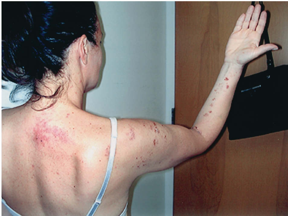
Figure 3. Cervical herpes zoster

In the immunocompetent patient with HZ, there are nu-