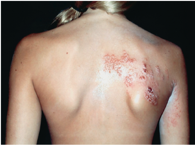
Figure 2. Thoracic herpes zoster

The rash associated with HZ has a brief erythematous and macular phase, which is often missed, after which papules rapidly appear. These papules develop into vesicles within 1–2 days, and vesicles continue to appear for 3–4 days. At this point, lesions of all types may be present (see figures 2–4). The lesions tend to be grouped, and clusters are often seen where there are branches of the cutaneous sensory nerve (e.g., in parasternal, mid-axillary, and paraspinous areas, representing the anterior and lateral branches of the anterior primary division as well as the posterior division of a thoracic nerve). Pustulation of ves-