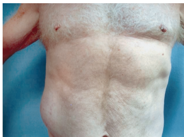
Figure 5. T8 motor neuropathy in an otherwise healthy 59-year-old man who presented with vesicles in the T8 distribution 4 weeks before this photo was taken. The patient was treated with an antiviral agent for 7 days and with analgesics as needed. As the rash resolved, this bulge became apparent; it is consistent with motor damage by varicella-zoster virus to the muscles of the abdomen.

Second cases of HZ are uncommon in immunologically intact hosts, presumably because an episode of HZ will boost immunity and thereby prevent subsequent symptomatic VZV reactivations. The available data suggest that second cases of HZ occur in \leq 5\% of individuals, although this conclusion is limited by the duration of follow-up, uncertainty of the di-