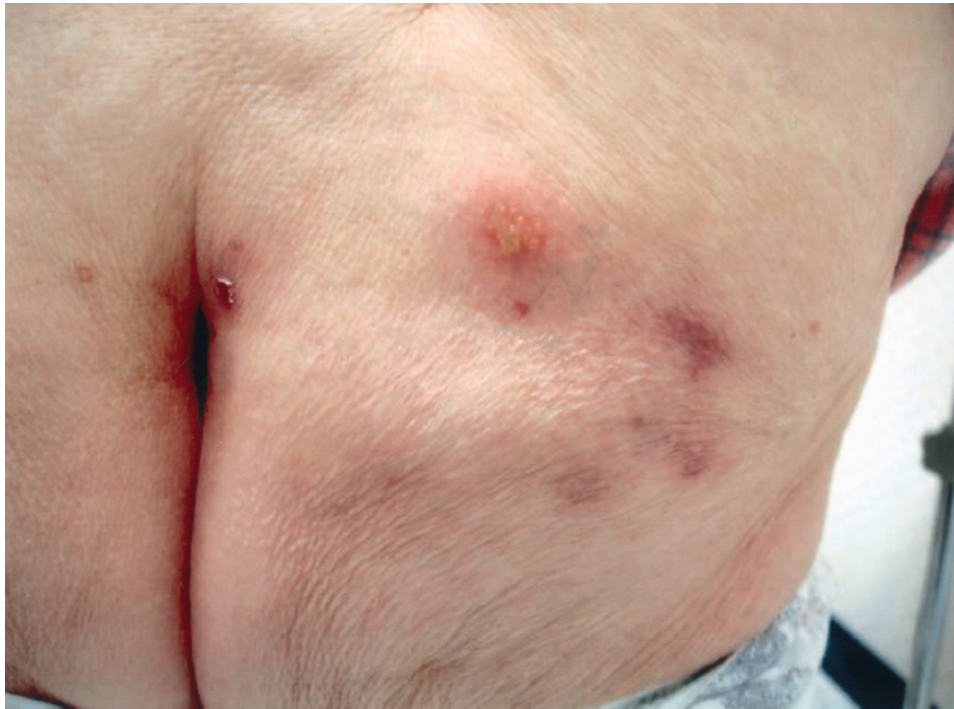
Figure 7. Zosteriform herpes simplex in an elderly woman who presented with what she called “her recurrent shingles.” Vesicles in a lumbosacral distribution had recurred many times over the past several years, and this outbreak began 1 week before the photo was taken. A viral culture demonstrated herpes simplex virus type 2. The patient was otherwise healthy, except for hypertension.

of a similar rash in the same distribution (to rule out recurrent zosteriform herpes simplex; see figure 7); and (6) pain and allodynia in the area of the rash. Allodynia, which is common in both HZ and PHN, is pain evoked by a stimulus that does not normally cause pain—for example, light brushing of the affected area with a cotton swab.