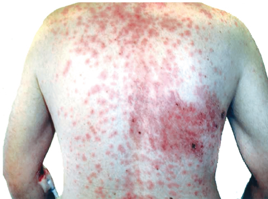
Figure 6. Disseminated herpes zoster

agnoses, and incomplete information about comorbid disease [32–34].