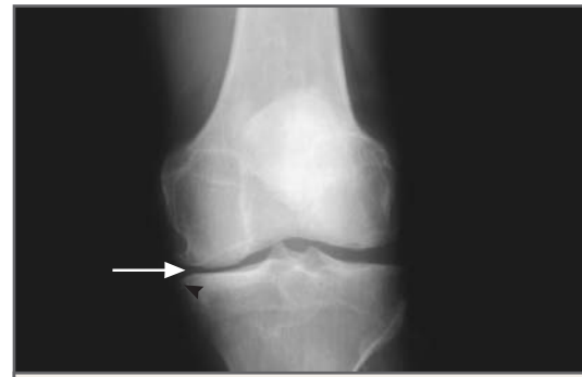
Figure 2. Radiograph Showing Osteoarthritis of the Medial Side of the Knee.

For treating the pain of osteoarthritis of the knee, head-to-head randomized trials showed that nonsteroidal antiinflammatory drugs (NSAIDs) and cyclooxygenase-2 (COX-2) inhibitors are more efficacious than acetaminophen. 19,20 However, the superiority of NSAIDs over acetaminophen (at doses of 4 g per day) is modest. 20 In one large crossover trial, 19 the average reduction in pain during the first treatment period, on a scale of 0 to 100, was 21 in patients treated with NSAIDs and 13 in those given acetaminophen ( P < 0.001 ). Because of the greater toxicity of NSAIDs, acetaminophen should be the first line of therapy. Acetaminophen appears less effective, however, among patients who have already received treatment with NSAIDs; in the crossover trial there was no improvement overall with acetaminophen in patients treated after a six-week course of NSAIDs. 19 Low doses of antiinflammatory medications (e.g., 1200 mg of ibuprofen per day) 21 are less efficacious but better tolerated than high doses (e.g., 2400 mg of ibuprofen per day). 22 One strategy to decrease the potential gastric toxic-